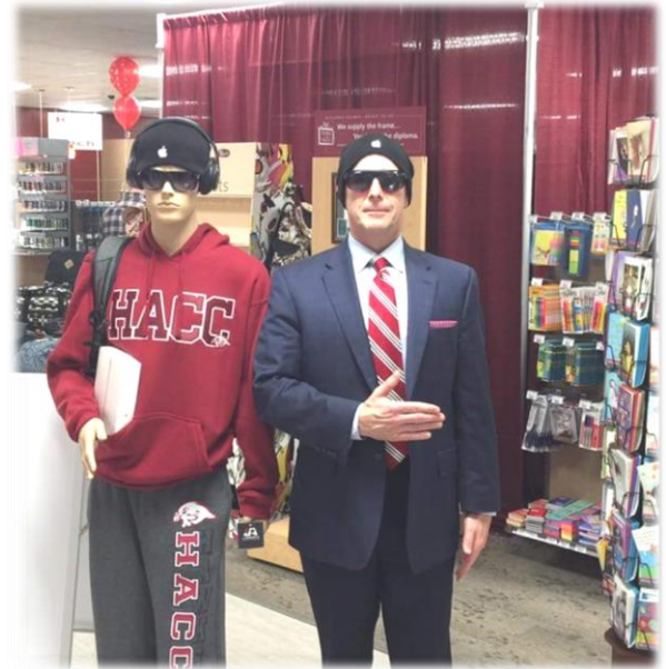
What better place for a mannequin challenge than at the Harrisburg Campus Bookstore during the HawkTech Store grand opening!

a perfect area to display new arrivals and other bookstore merchandise. The store remained open to serve customers through the entire renovation and celebrated its grand reopening on Wednesday, Oct. 5, 2016. To quote one student, we are now “quite fancy and actually look like a real college bookstore.”